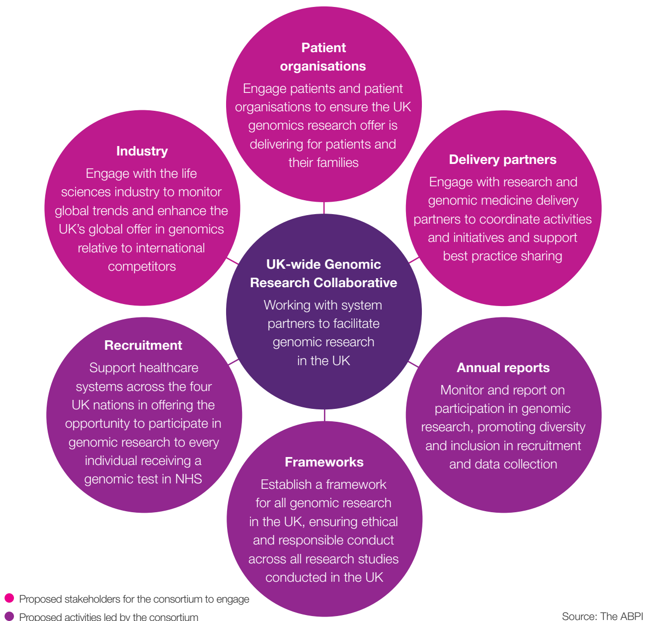
Figure 2. A proposed national approach for genomic-enabled research and development